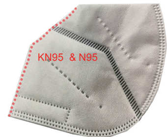
edge close demo as red dot showing